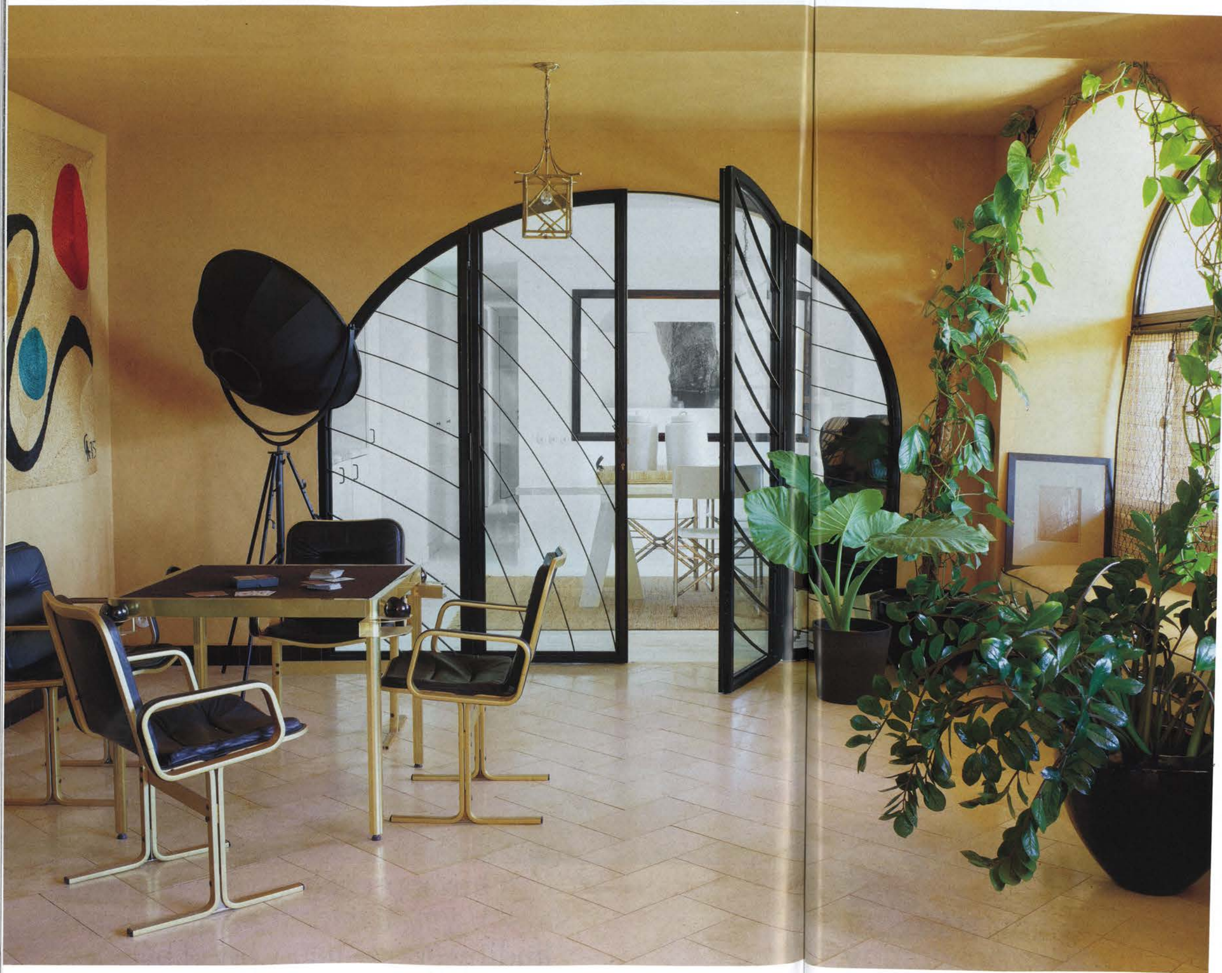
ABOVE IN ISABEL ETTEDEGUI'S WINTER GARDEN ON THE FRENCH RIVIERA, DESIGNER INDIA MAHDAVI SET A FORTUNY FLOOR LAMP BEHIND A 1970S CARD TABLE AND CHAIRS THAT ONCE BELONGED TO ACTOR OMAR SHARIF. OPPOSITE IN THE ENTRANCE HALL, A SERGE MOUILLE CEILING FIXTURE JOINS FORNASETTI CHAIRS AND A TABLE FOUND IN LONDON. FOR DETAILS SEE SOURCES.