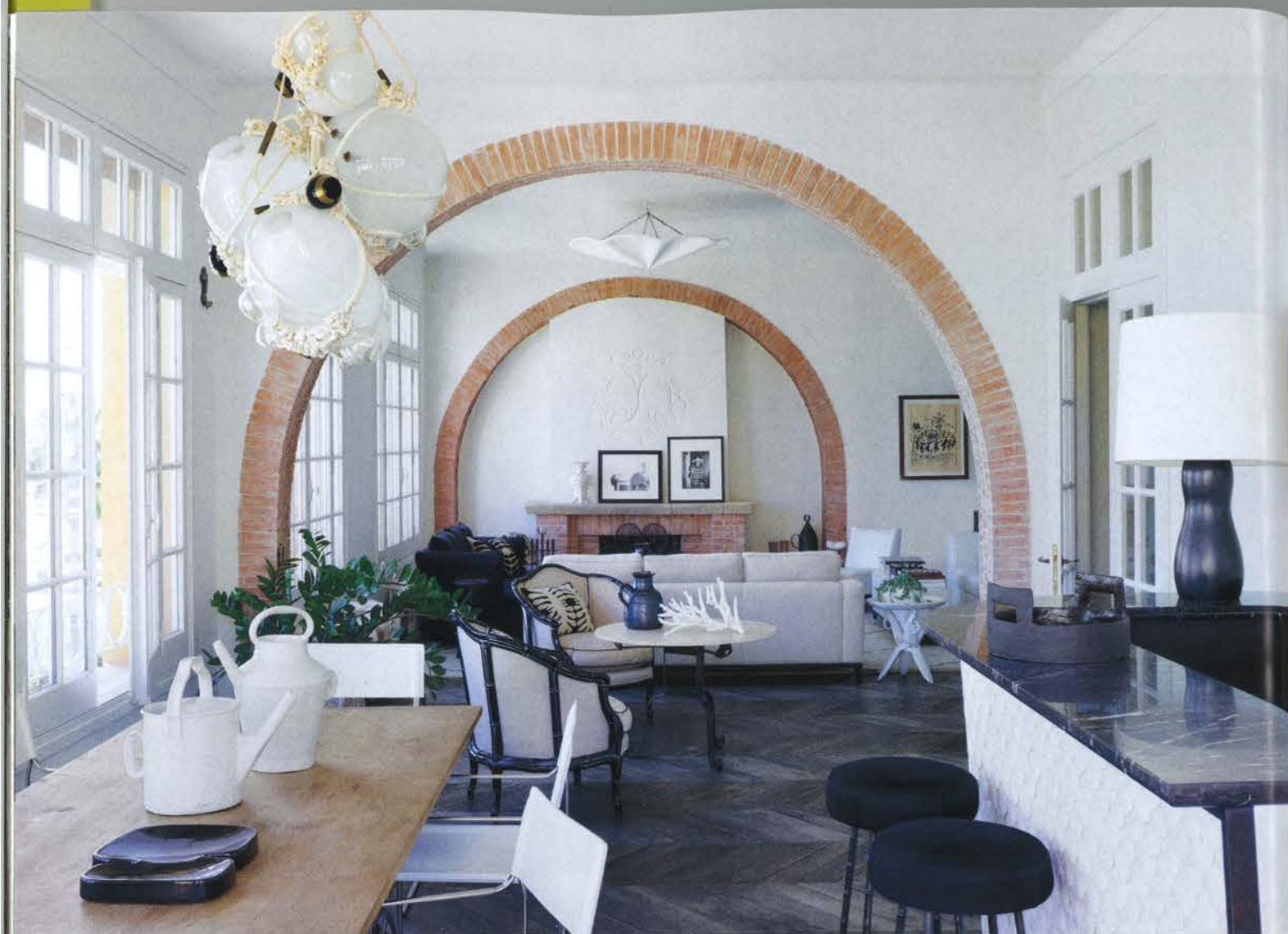
OPPOSITE IN THE MAIN LIVING AREA, A LINDSEY ADELMAN CEILING LIGHT IS SUSPENDED ABOVE A ROSE UNIACKE DINING TABLE AND GAE AULENTI CHAIRS; A CHRISTIAN LIAIGRE LAMP STANDS ON THE CUSTOM-MADE THOMAS BOOG BAR.