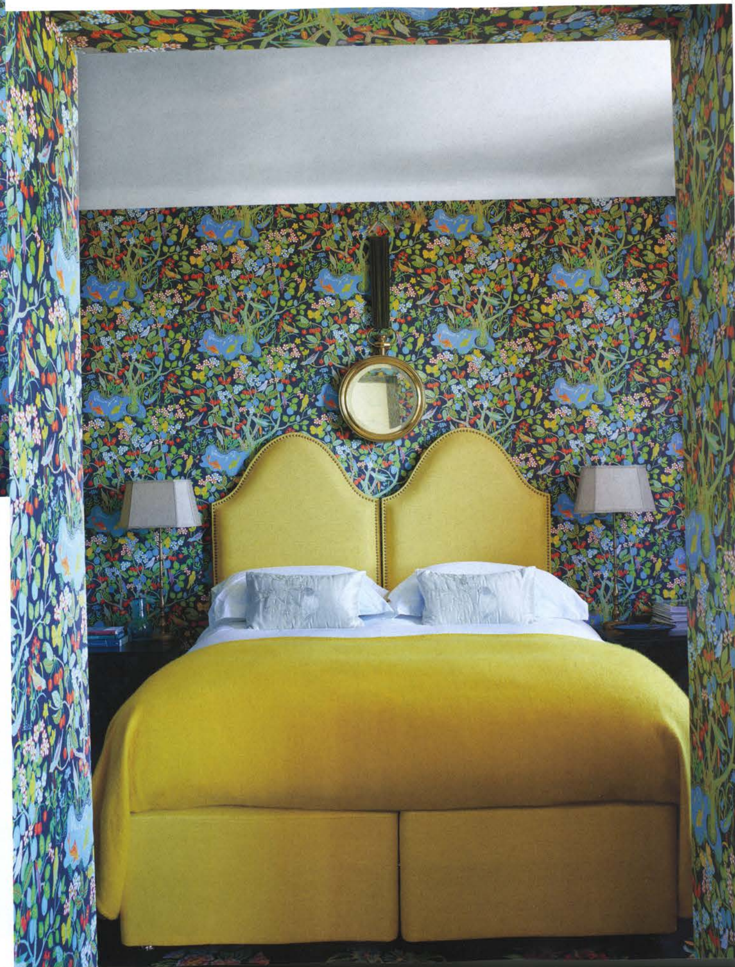
BELOW A JOSEF FRANK WALLPAPER FROM SVENSKT TENN TRANSFORMS A BEDROOM INTO A GARDEN. BEAUDESERT BEDS.